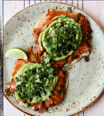
Sample menus shown are subject to change without notice. Prices do not include tax & gratuity.